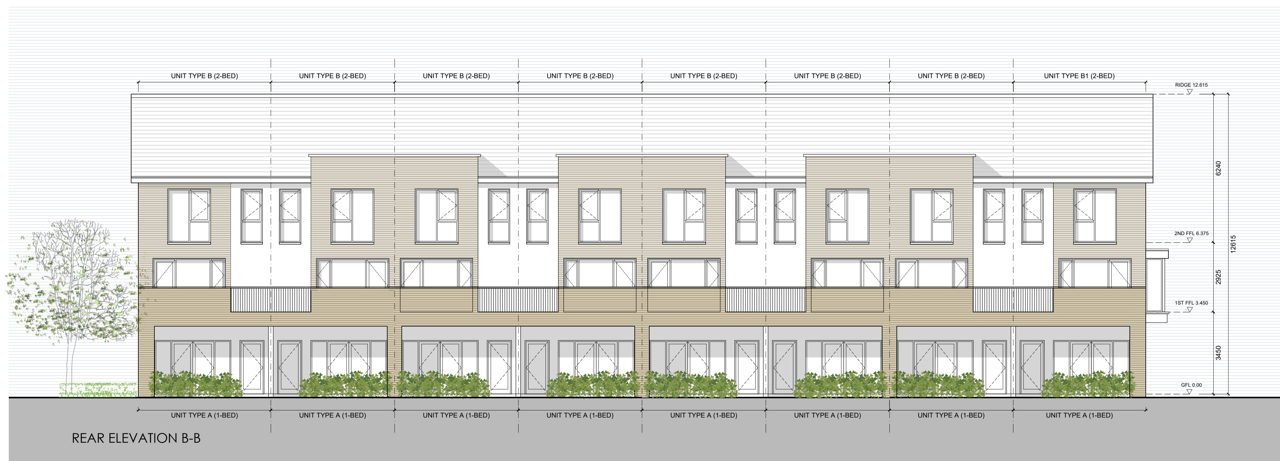
REAR ELEVATION B-B