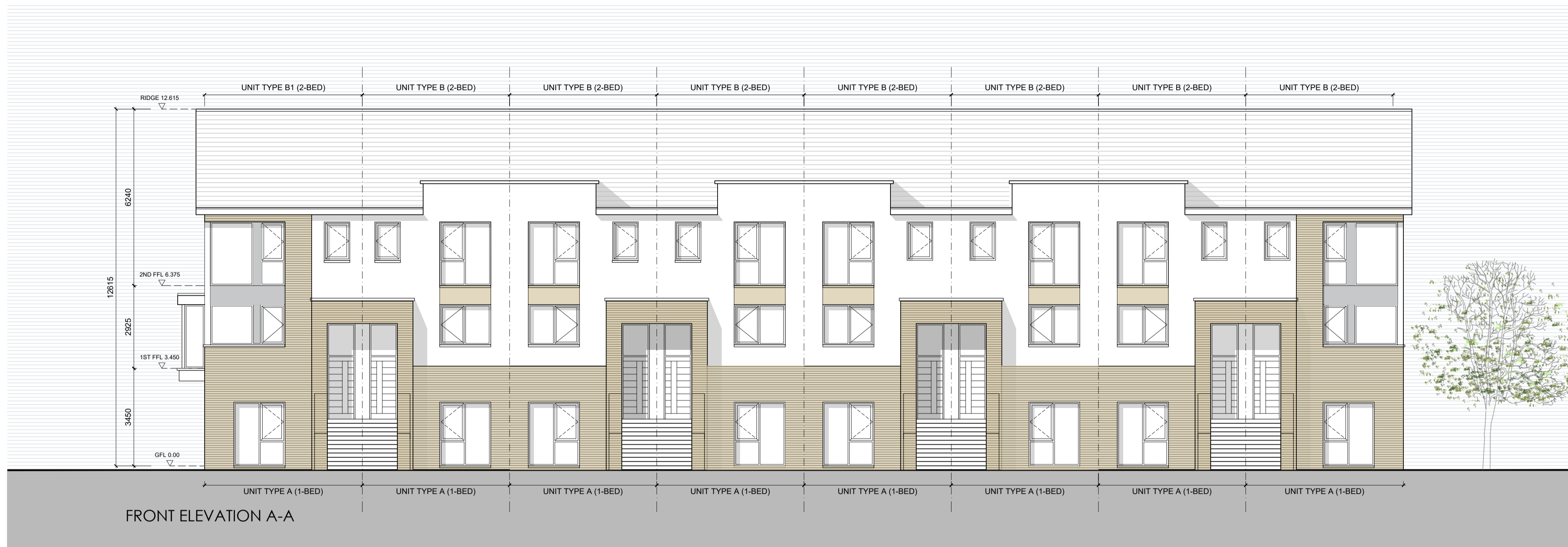
FRONT ELEVATION A-A